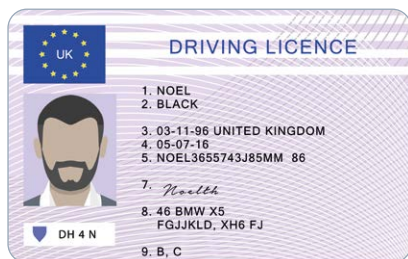
Photo Driving Licence

If we ask you to confirm your identity and residence, a certified copy of your photo driving licence will meet our requirements in all cases.